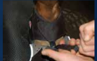
5. Pull the strap up and secure