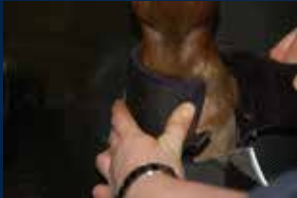
3. Put the velcro together