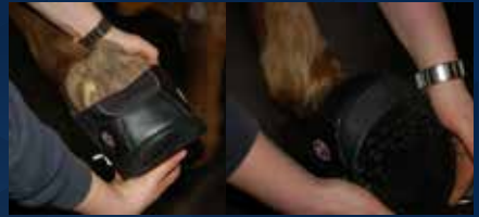
2. Place the shoe on the hoof