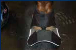
6. Lift the front flap to closed position