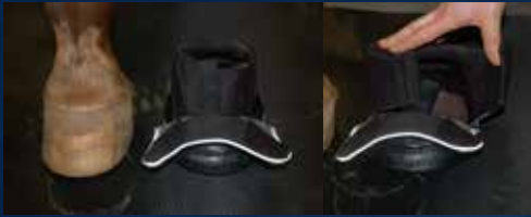
1. Open the shoe wide