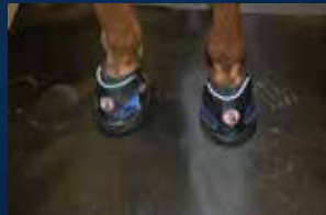
7. Ready to go!