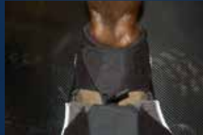
4. Align both velcro